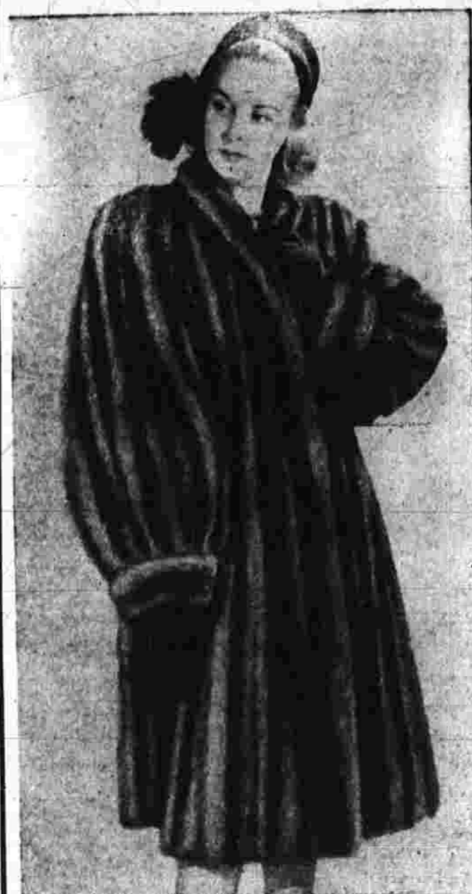
Mutation Dyed Muskrat $249