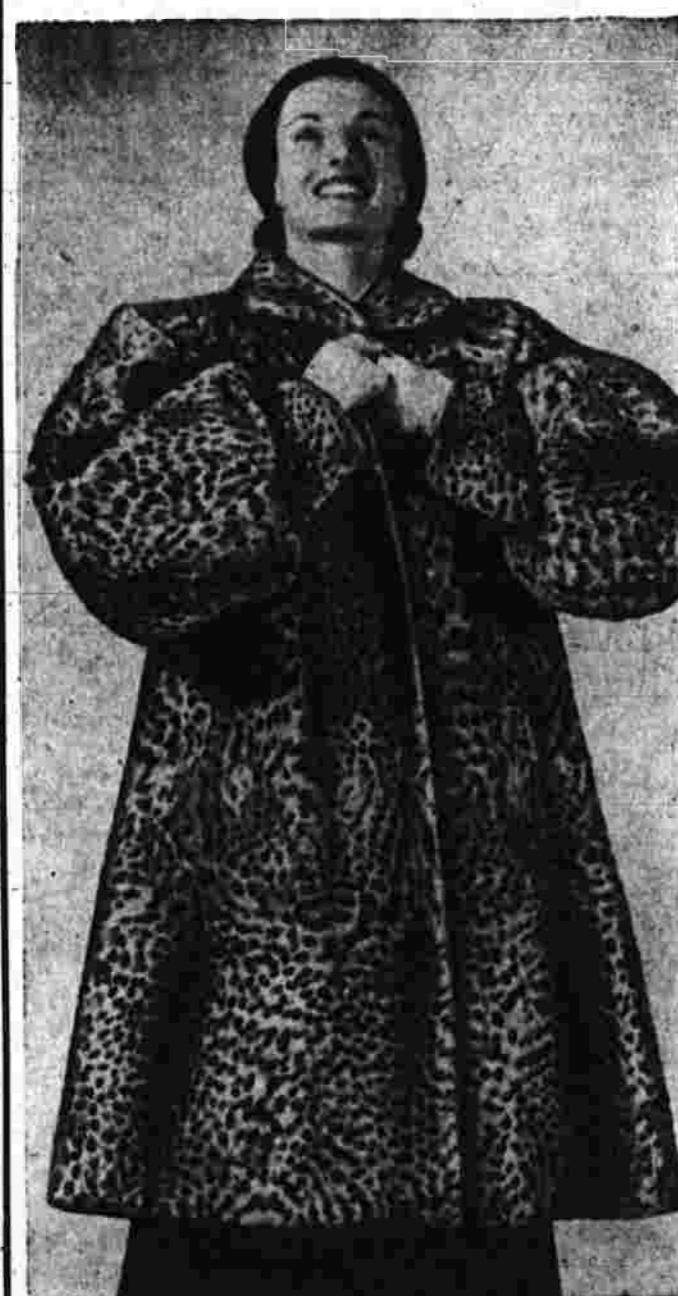
Natural Ocelot $399

10% DOWN PAYMENT RESERVES YOUR SELECTION 10 MONTHS TO PAY Free Storage Air-Conditioned Second Floor.