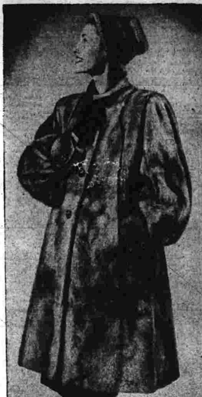
Natural Grey Chinese Kidskin $199

Once again our Fur Department opens its season with new beautiful choice Fur Coats. You are cordially invited to attend our Fur Season opening and be convinced of the exceptional values offered by us. The Furs are so beautiful and the prices are so reasonable that you will want to reserve your selection NOW for next winter.