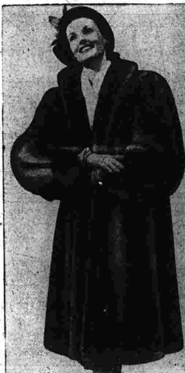
Mouton Lamb $159